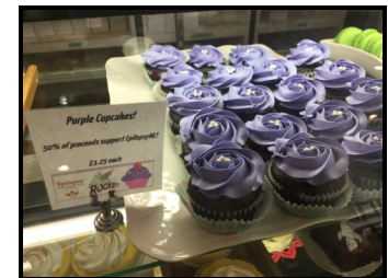
Purple Cupcakes 2018

Cupcakes are always a favourite, and this year they were a huge hit, selling out in hours! ENL would like to extend a big thank you to Rocket Bakery and Fresh Foods for their continual support in raising Epilepsy Awareness in Newfoundland and Labrador. Rocket Bakery is located in Downtown