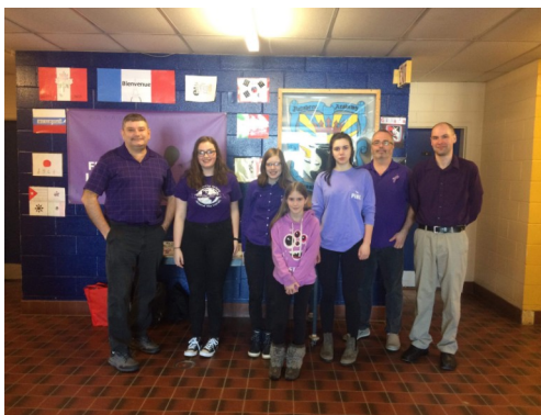
Pasadena Academy 2018

In the past few years, my school has always been a supporter of Purple Day. The majority of students wear purple and have been supportive of the students in the school with epilepsy. I always set up a table with information and ribbons where people can come ask me questions and learn a little more about epilepsy. A few years ago we had the paint your thumb purple activity where you could paint your nail purple with nail polish. Surprisingly, this went over well with